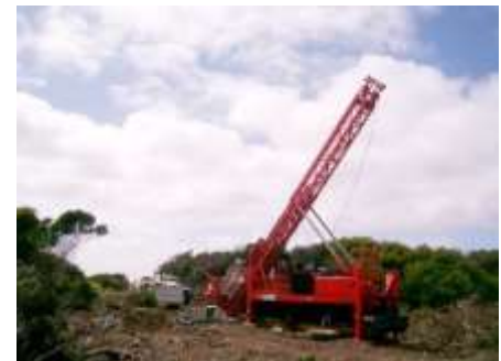
Drilling rig conducting geotechnical work