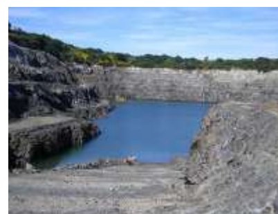
Dolphin open cut mine, dewatering underway