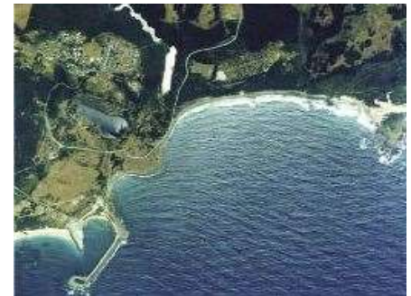
Current restored site