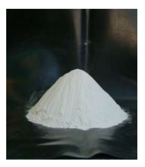
Product-High Purity Silica Flour

On-going product improvement investigations are aimed at further expanding the size of the current resource. The current resource could support a project life well in excess of 10 years at an annual production rate in the range of 25,000-50,000 tonnes of saleable, high purity silica flour for export primarily into the TFT-LCD industry. The production of other display glass substrates, and for a wide range of applications in specialist niches of technical, scientific, optical and other high quality glass. The operation would also generate a co-product of about 10,000-20,000 tonnes per annum of low-iron silica sand.