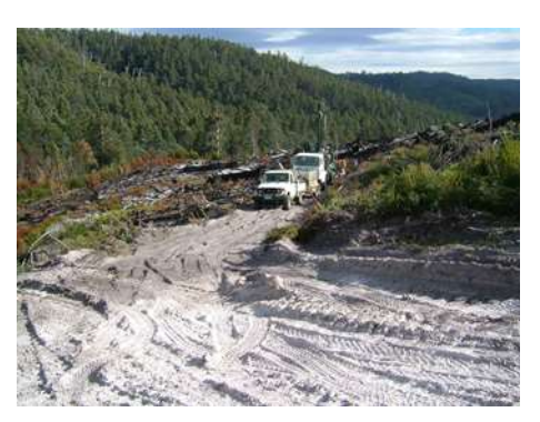
Resource Definition drilling

At around 35-40% by weight, the naturally occurring silica flour, identified as the economically most significant component of the deposit's sand mix, can be upgraded to high purity, high value products attracting price premiums for a range of niche applications primarily in the global, high-tech sector of the glass industry. The low iron silica sand by-product could realize additional commercial benefits.