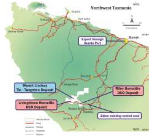
Location of Mount Lindsay, Livingstone & Riley

The Livingstone DSO Project is located only 3.5km from Venture's Mount Lindsay deposit and consists of an outcropping hematite cap overlaying a magnetite rich skarn. The Riley DSO Project, located 10km from the Mount Lindsay Project, sits at surface and is less than two kilometres from a sealed road that accesses existing rail and port facilities.