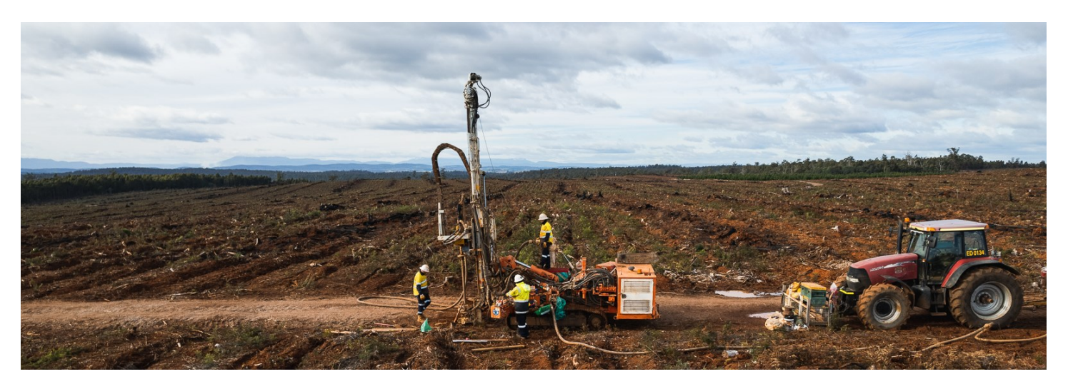
REE exploration underway at Deep Leads

ABx expects to announce an update to the JORC-compliant REE mineral resource in late Q1 2023, when sufficient laboratory results are received and resource data from the new campaign have been incorporated.