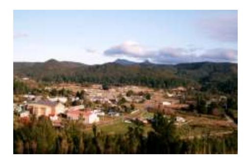
Zeehan Town & Queen Hill: Heemskirk Project