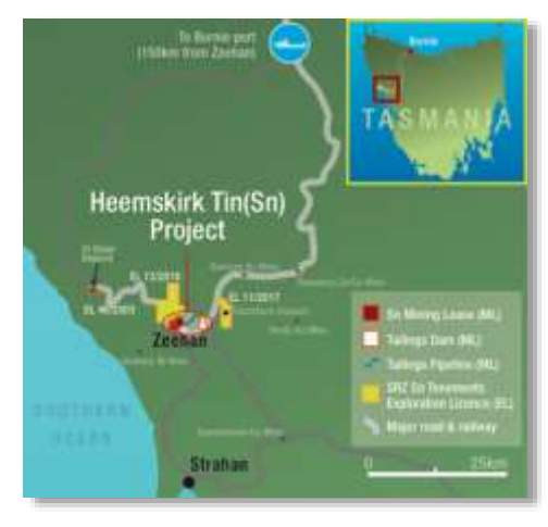
Heemskirk Tin Project location